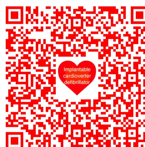
Implantable cardioverter defibrillator (ICD)