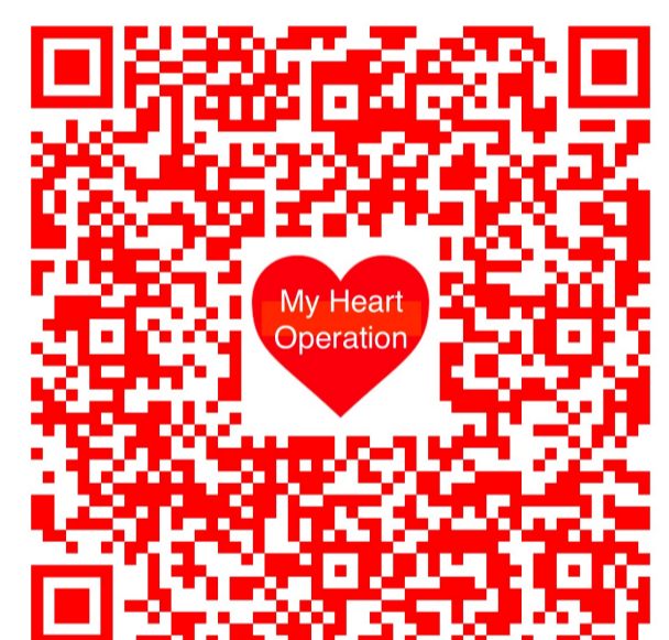
My heart operation