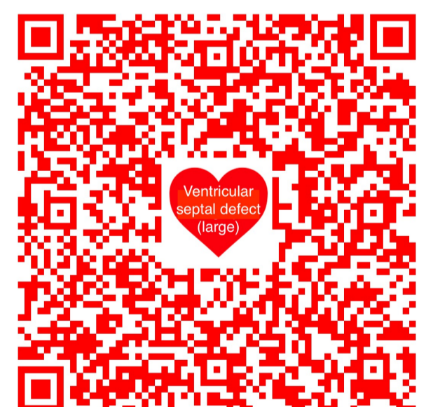
Ventricular septal defect (large)