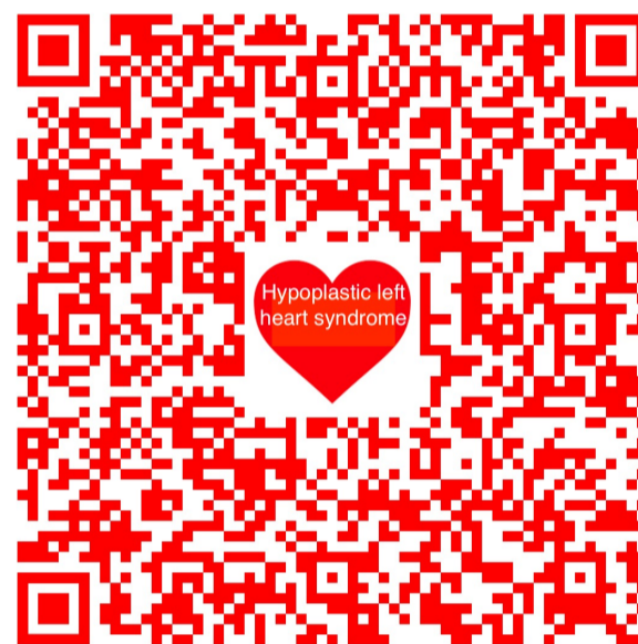
Hypoplastic left heart syndrome