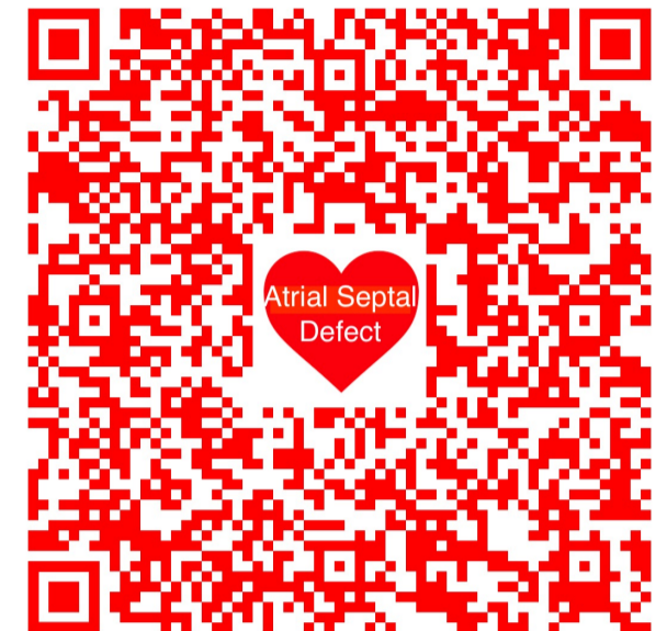
Atrial Septal Defect