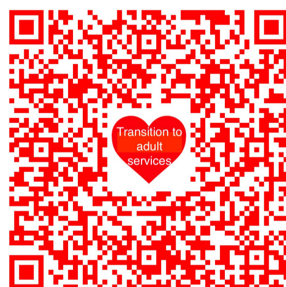
Transition to adult services