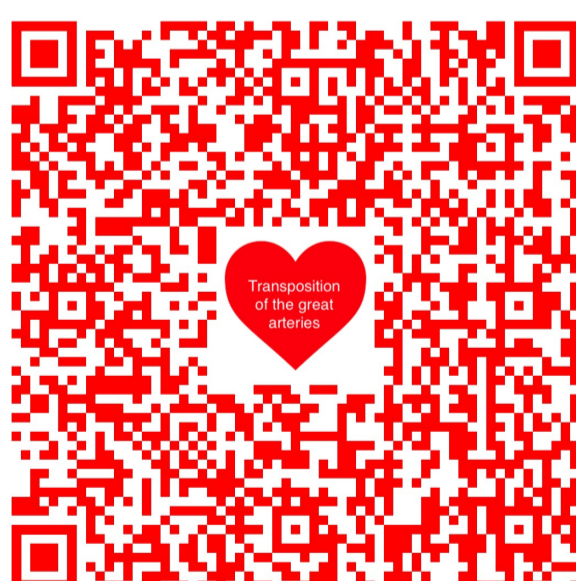
Transposition of the great arteries