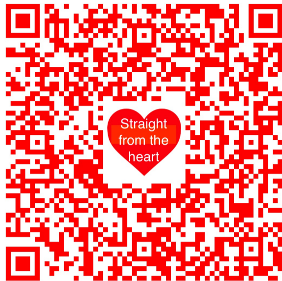
“Straight from the heart”