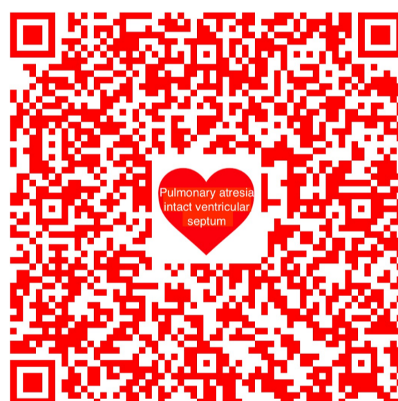
Pulmonary atresia with intact ventricular septum