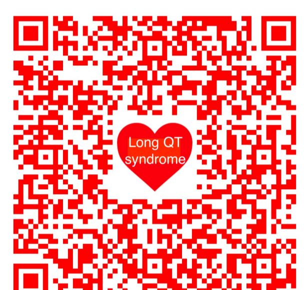
Long QT syndrome