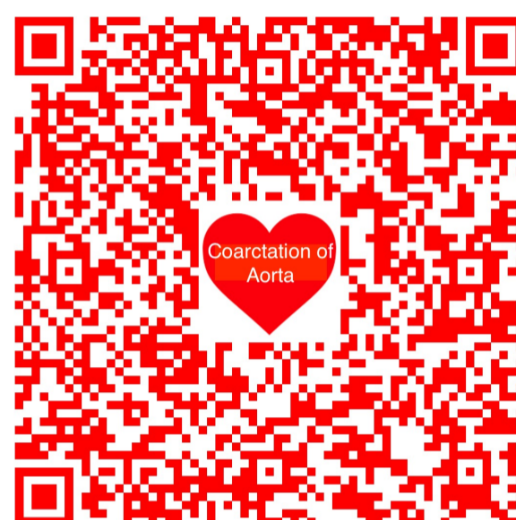
Coarctation of the Aorta